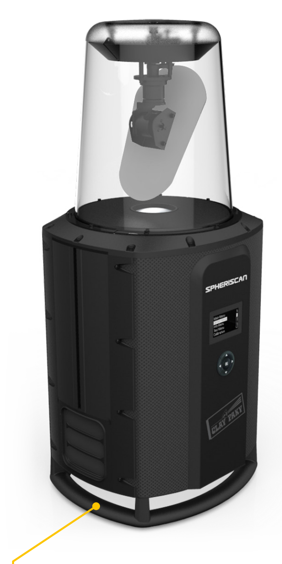
Strong handles can be used as ground support when the light is placed vertically on stage

The SPHERISCAN has all the effects of the most advanced moving-head spotlights: one wheel with 6 indexable and interchangeable rotating gobos, one wheel with 8 static gobos, a rotating prism, a fast sixteen-blade iris, a variable frost filter, a shutter-strobe and a dimmer. The colors may be inserted smoothly and linearly, and cover a broad spectrum shades, thanks to the CMY system and a 7-color wheel. The effects and movements are handled by a sixteen-bit controller.