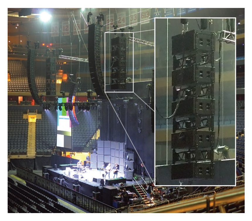
Figure 2: Cardioid Inverted Stack Gradient Array In Use—Ed Sheeran at Madison Square Garden

As an additional benefit, MAS-1100 Array Spacers improve the back-to-front level difference for cardioid inverted stack gradient arrays, as shown in Figure 2, by allowing the acoustical energy to flow freely between the forward and rearward enclosures while reducing timing errors caused by physical self-obstruction.