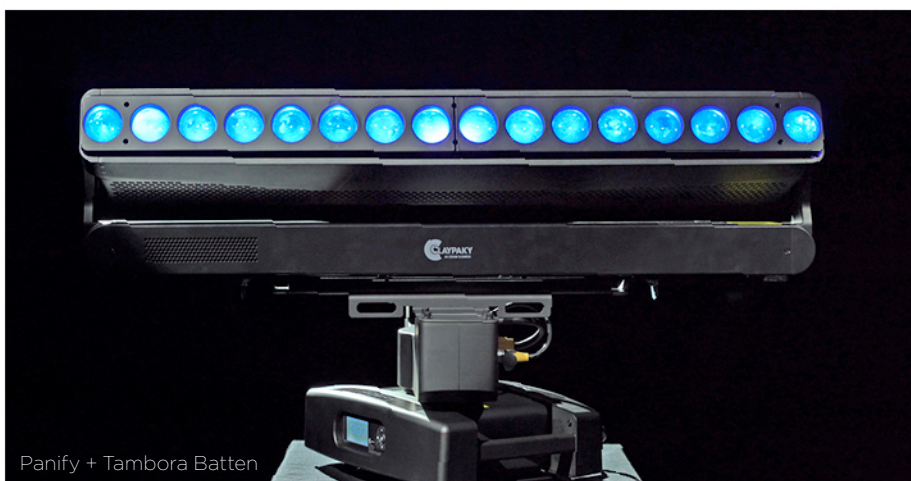
Panify + Tambora Batten

The PANIFY is not limited to fixtures and could be used to turn scenery, signs, screens and more. The unit is IP66 rated and can be used and hung in any position. The PANIFY expands and extends the usefulness of static fixtures or whatever you need to turn for your productions. Its flexibility and versatility allow the PANIFY to be anything you need it to be.